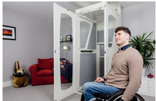
Harmony Fully Enclosed Homelift